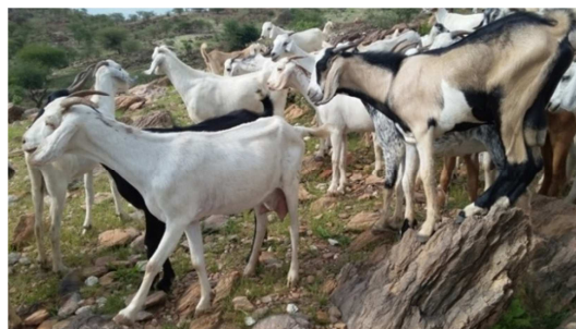
Flock size (TLU): minimum (0.7) and maximum (13.5)

Sample Photos of Begait, Hassan and Arado Goat Populations