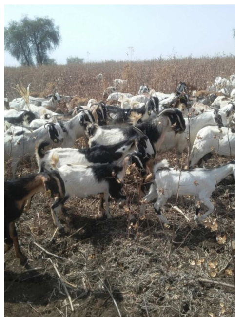
Flock size (TLU): minimum (1.0) and maximum (21.0)