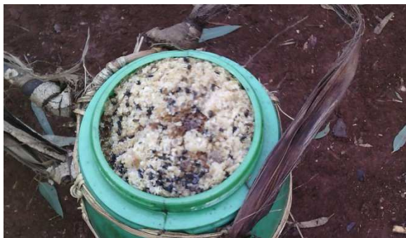
Figure 5. Crude honey with a lot of dead bees and hive debris ready for sale at rural village market, Meti Zuria.

In most of the cases, domestic honey market starts at the smallholder beekeepers level when they sell crude honey to collectors in the nearest village markets who show up during honey harvesting seasons [8, 13, 16, 17]. In this study also, it was found that honey producers largely sold their honey in the nearest local market (76.2%). Only less than 24% of the respondents transport their honey to the district town (Meti) using pack animals looking for better prices. The distance of the village markets from Meti town are about 15-20km. However, the price assessment showed as high as 70% price difference between the two market locations. The two major honey buyers reported by the producers are the collectors (82.45%) and tej brewers (16.32%) in Godere district. The collectors play significant role in assembling and distribution of the honey within and outside the district. According to the Godere district Agriculture Products Marketing Department, who provides permit for the transport honey out of the area, 85 people had certificate to buy and transport honey. In 2017/8 April- June harvest season only, they estimated about 230 tons of honey was moved from the district to other destinations, as far as to Addis Ababa (personal communication).