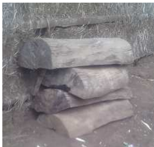
Figure 3. Logs prepared from Croton macrostachyus for traditional hive ( korsho ) making, at kabo kebele.

The beehive holding of the beekeepers showed that almost all respondents use only traditional log hives. The average number of traditional beehive holdings (28 beehives) shows significant differences from what was reported from around Burie (8 beehives) and from Gera area (64 beehives) [5, 16]. No beekeeper was practicing exclusively using transitional or frame hives. In fact only 27 frames hives and 16 transitional beehives were reported to exist by the beekeepers that account only for about 1.25%. They have been using log hives to bait swarm colonies and honey production. The log hives used in the area are made of different tree species. The Mejang make their log hives from Cordia africana that measures about 2 to 2.5 m in length. According to the beekeepers, this log hive type has better durability compared to similar one but made from logs of Croton macrostachyus , by the highlanders called “ korsho ” (Figure 3).