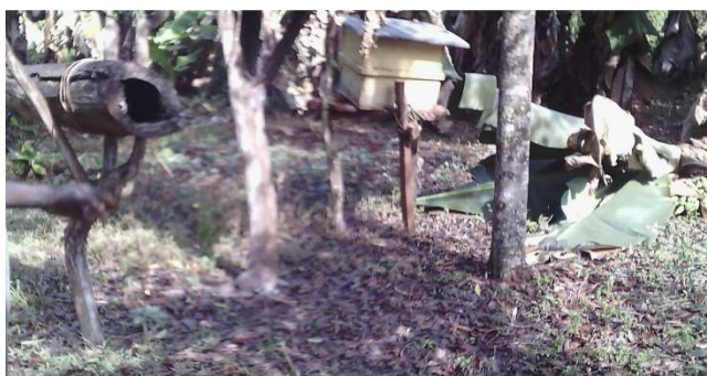
Figure 4. Backyard apiaries (left) at Kabo, group of men own some hives (right) at Meti Zuria, individual beekeeper.

The southwestern part of Ethiopia is known for its high honey production compared to any other parts of the country [1]. The case of Godere district proved to be not different. The average honey yield of traditional hives according to the District Agriculture and Rural Development Offices estimation is 18kg/hive/annum [10]. However, the average yield of 24.2kg/ hive / year from traditional hive reported in this study is significantly higher than what is considered as national average productivity for traditional hives, 7.27 kg crude honey/hive/annum and a lot of previous reports even from the potential areas [2, 13, 15, 20]. Even though few frame and transitional hives are owned by interviewed beekeepers no yield data were available on the productivity of the colonies in these hives. However, this high maximum honey yield potential in the traditional beehives, 40kg/colony/annum, suggests the existences of high possibilities of maximizing the yield through introducing improved beehives with appropriate seasonal management of honeybee colonies.